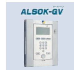
Service allowing information on when employees arrive at and leave work to be viewed and facilities to be operated remotely via the Internet

In the fiscal year ended March 31, 2015, we continued to offer products and services based on the security expertise we have accumulated through operations in Japan and custom-tailored to the characteristics of specific countries. For example, we launched the first electronic security services operations to be directly managed by the Company in Thailand. ALSOK will vigorously develop its overseas operations into the future with the aim of supporting customers conducting business outside Japan.