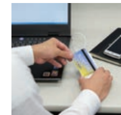
Solutions service that respond to new risks and needs