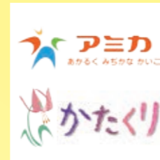
Long-term care service brands AMICA (HCM Corporation) KATAKURI (ALSOK Care & Support Co., Ltd.)