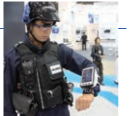
Security guards armed with wearable cameras, smart-phones, and other IT equipment