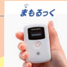
Mobile security terminal equipped with communications and safety confirmation functions