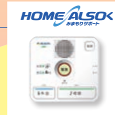
Monitoring of senior citizens 24 hours a day, 365 days a year as they go about their daily lives that provides emergency reporting and consultation services