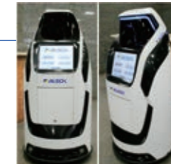
Robots with personnel identification and automated patrol functions