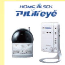
Monitoring service that enables customers to check images and sound recordings on the go