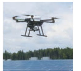
Services that utilize aerial robots to inspect the panels of large-scale solar power installations